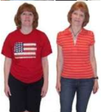
See more at Stories at www.GetYouInShape.com